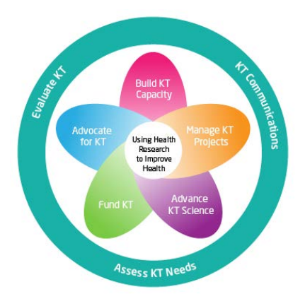
Figure 1 KT Model

To guide our KT program activities, we developed an evidence-based KT model that identified five functional areas through which funders can work to create the conditions for effective KT: funding KT, building KT capacity, managing KT projects, advancing KT science, and advocating for KT (see Figure 1).